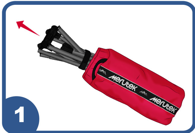
Pull chair out of carry sack