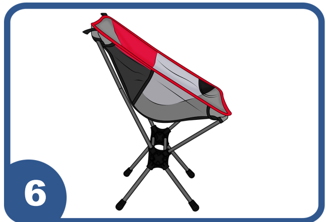
Chair is completed