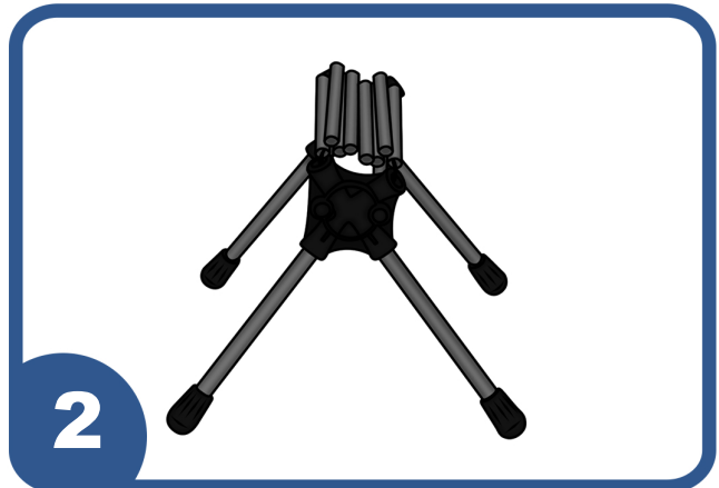
Unroll bundle and setup base structure