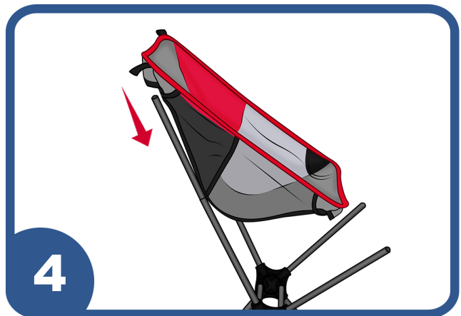
Place fabric on frame starting with top seat position